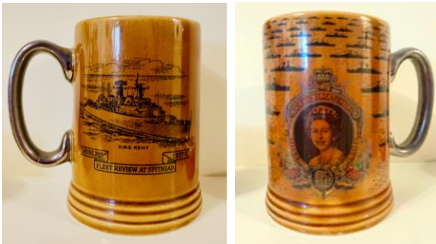
Ceramic Kent Jubilee Mug

He did eventually manage to get the ship cleaned and painted in time and the Fleet Review went magnificently.